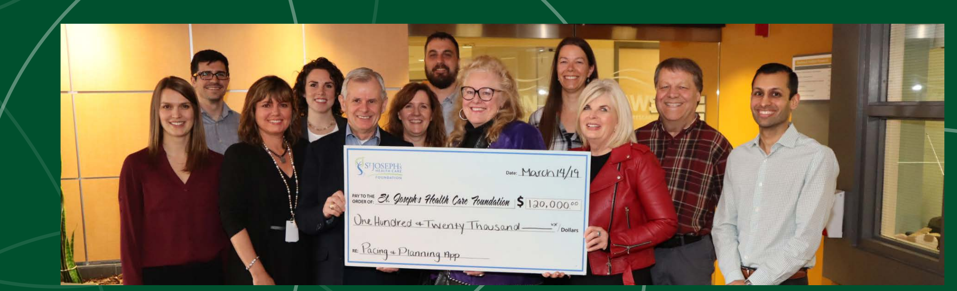
The Cowan Foundation supports the creation of a post-concussion app by St. Joseph's Health Care Foundation, London